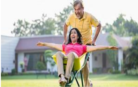
GAGAN LIFESPACE - NULIFE