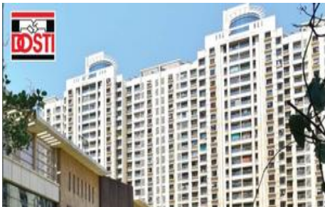
DOSTI REALTY LTD.