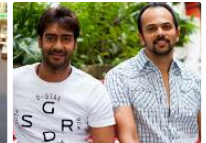
Rohit Shetty kick-starts shooting of