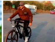
SPOTTED: Salman Khan takes his cycle