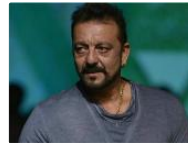
REVEALED! Here's the film Sanjay Dutt will