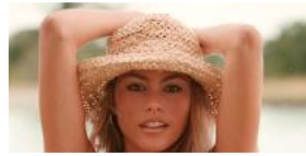
Sofia Vergara's bikini pic 10