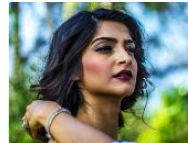
Sonam Kapoor: I have not had one flop film