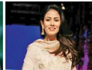
Mira Rajput opens up about her Bollywood