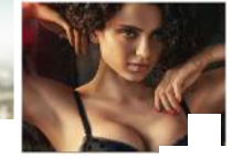
Kangana Ranaut's EXCLUSIVE interview