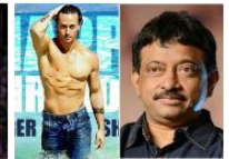
Tiger Shroff: I can never be half the man